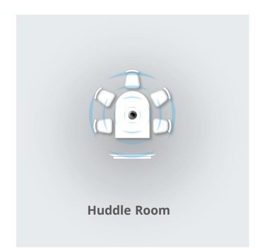
Disclaimer:- Room setup diagrams are provided for reference only. Actual room setup and size may vary as per requirements.